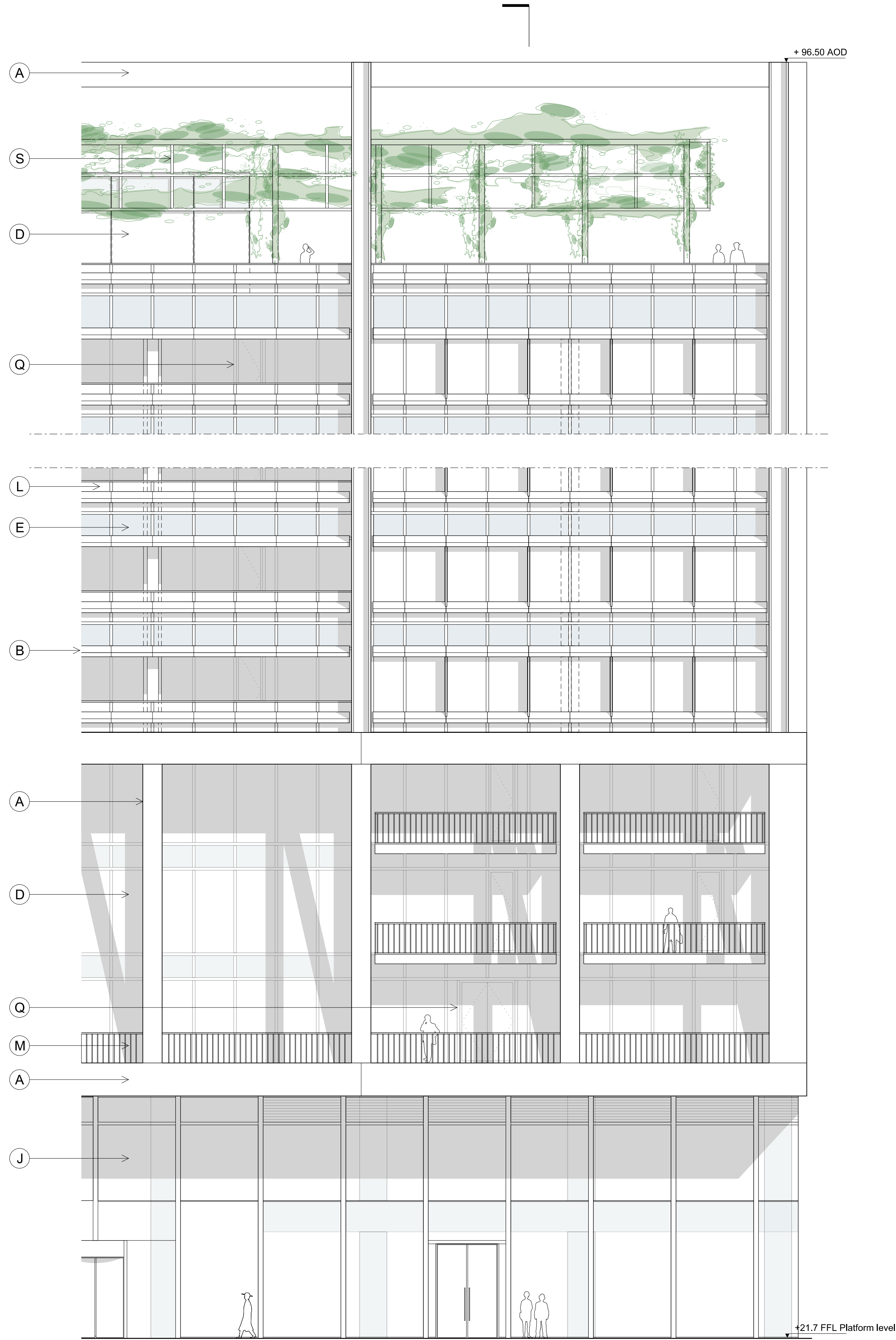
01 Elevation 05-4-402 Facade Study South Balconies 1:100 @A1